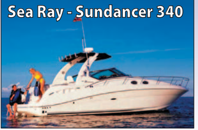
11.50 m/2 x 340 HP 10 persons

Season: 1200 €/day Off season: 1100 €/day