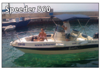
Season: 370 €/day Off season: 350 €/day